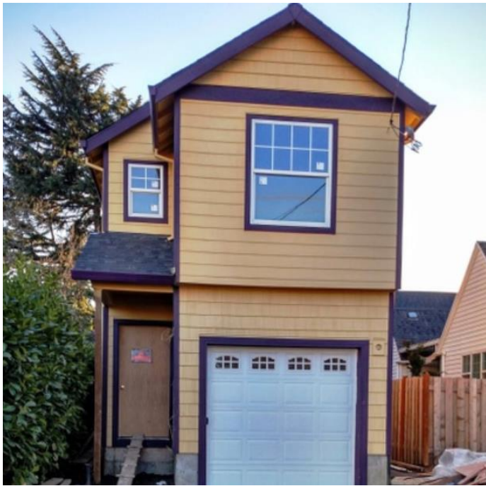
Nearly-finished skinnyies on the three developed lots