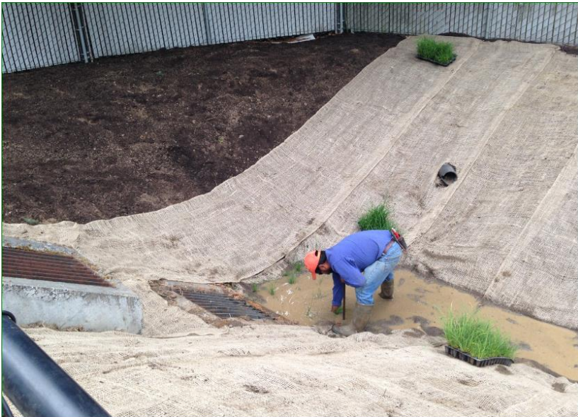
After Construction – WQF