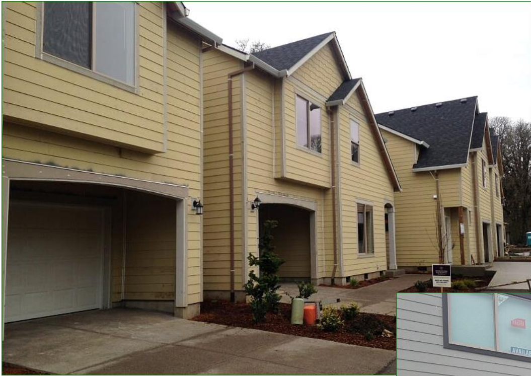
Houses near completion